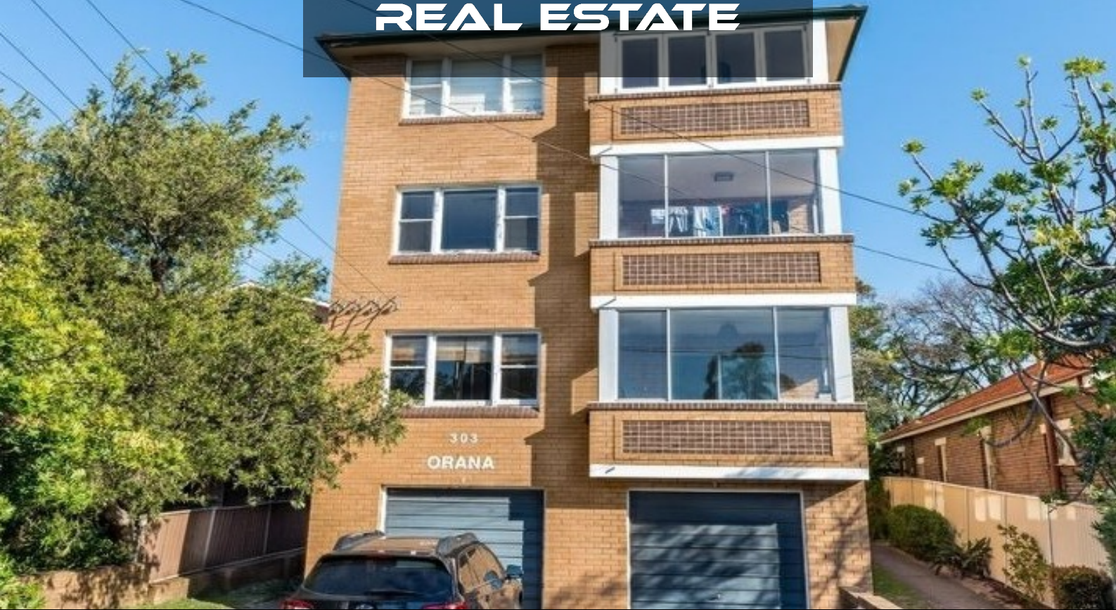
9/303 Maroubra Rd , Maroubra